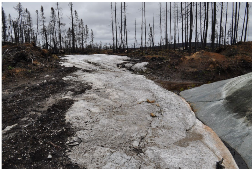
Figure 1. Pegmatite dyke exposed post 2023 wildfire.

In 2023 the fires prevented much of the planned exploration at the Discovery Property, but the fires were successful in exposing additional outcrops on the property (Figure 1).